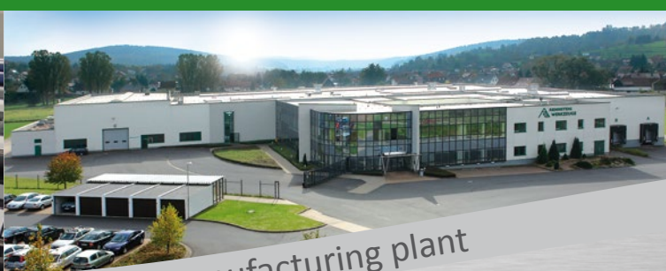
German manufacturing plant