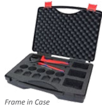
Frame in Case