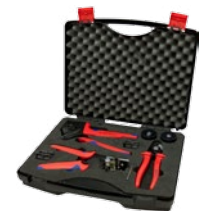
Case for Crimp System Tool, Insulation Stripper, Cable Cutter, Die Sets, Locators